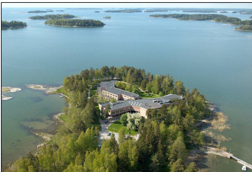
Conference venue “Hanasaari” - the Swedish-Finnish Cultural Centre